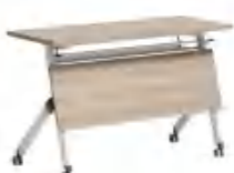
STRIP TABLE : AD-TY-C0314Y-1 1400W*500D*750H AD-TY-C0312-1 1200W*500D*750H