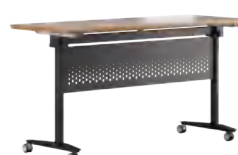
TRAINING TABLE (CUSTOM) AD-GRM-312-12 1200W*550D*750H AD-GRM-312-14 1400W*550D*750H AD-GRM-312-16 1600W*600D*750H