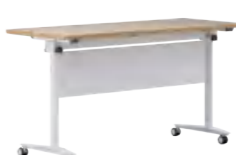
TRAINING TABLE (CUSTOM) AD-GRM-312-12 1200W*550D*750H AD-GRM-312-14 1400W*550D*750H AD-GRM-312-16 1600W*600D*750H