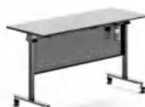
FOLDING TABLE: AD-GRM-306-12 1200W*550D*750H AD-GRM-306-14 1400W*550D*750H AD-GRM-306-16 1600W*600D*750H