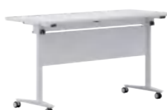
TRAINING TABLE: AD-GRM-312-12 1200W*550D*750H AD-GRM-312-14 1400W*550D*750H AD-GRM-312-16 1600W*600D*750H