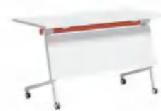
STRIP TABLE : AD-TZ0812 1200W*450D*750H AD-TZ0814 1400W*450D*750H