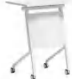
PODIUM: AD-JT007 900W*550D*1015H